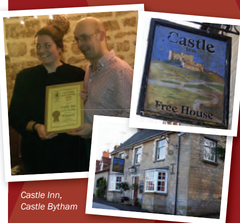
Castle Inn, Castle Bytham

Three closed pubs have been the subject of local community or CAMRA activity - The Spread Eagle at Hockerton, The Plough at Coddington and The King's Head at Collingham. We're pleased to announce that following an application by Newark CAMRA, the Plough at Coddington has been listed as