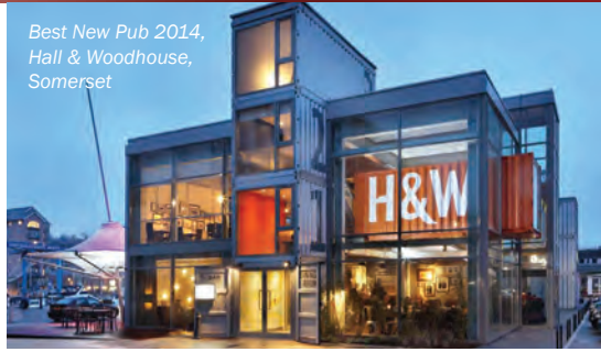
Best New Pub 2014, Hall & Woodhouse, Somerset

pastiche of Edwardian, Victorian or even Georgian artefacts. Or it could be completely modern, using materials of the 20th or 21st century.