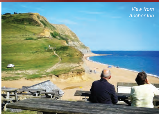
View from Anchor Inn

Our first port of call was the Royal Standard, which like its next door neighbour The Harbour Inn, backed onto the sea front with the front entrance (which we never used) off a narrow road on the other side. Walking in off the beach there is a sizeable patio area, a separate hatch for food sales, and incongruously a pool table just inside the door which you have to carefully circumnavigate to get to the bar. Four ales on handpump, all from the Palmers brewery up the road in Bridport, and fine quality Dorset Gold (which was to prove pretty common during the week) and Palmers were sampled. The main memory from this place though was the 'whole crab' – no