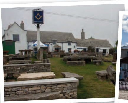
Square & Compass